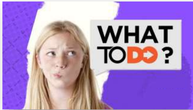
Message “What To Do?”

8:30am & 10:30am Services visit www.rumcoh.org